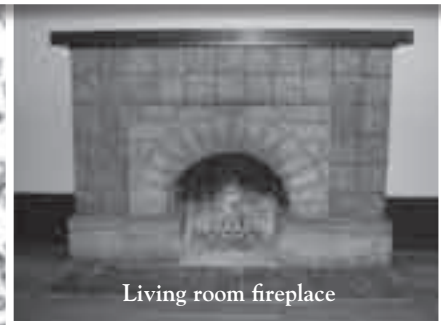
Living room fireplace