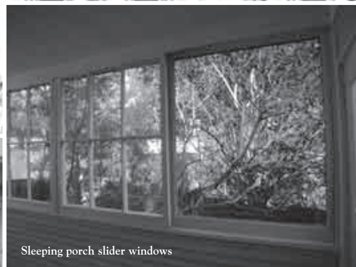
Sleeping porch slider windows

Thought to have been extinct for thousands of years, this plant was found growing in a few isolated sites in its native China during the 1940s. It is a pyramidal tree with small cones and soft, pale green needles that turn light bronze in autumn, then drop to reveal attractive winter silhouette. While in leaf, it also bears superficial resemblance to coast redwood.