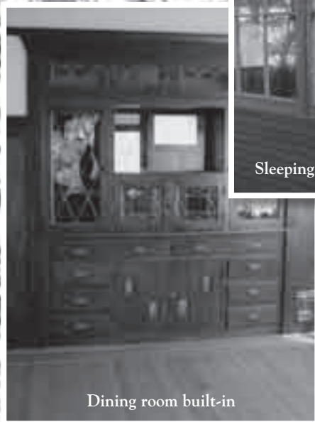
Dining room built-in