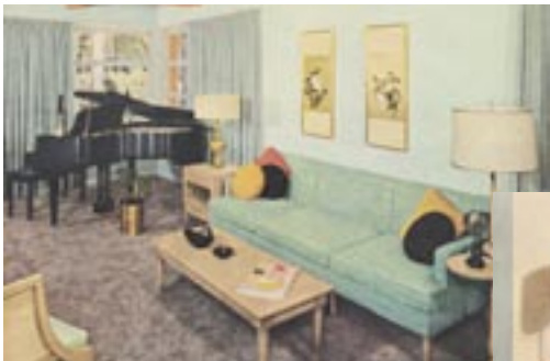
Interiors shown, from Home magazine '56, resemble 6024 Johnston when new & made up.